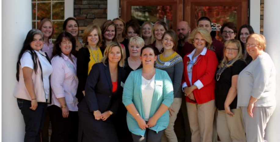
October Leadership Meeting

As the 2015 year comes to an end, we want to thank you for your partnership with us. Moms in Motion is now an organization of more than 85 people dedicated to serving our community. We visit approximately 1600 individuals each month to facilitate consumer-directed waiver services and provide case management. We are so thankful to you for entrusting us with your services, and we look forward to continuing to work with you in the coming year.