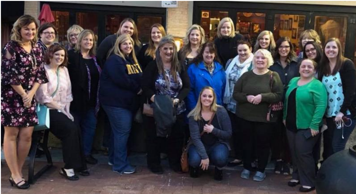
Our Family Resource Specialists and Admin Team!